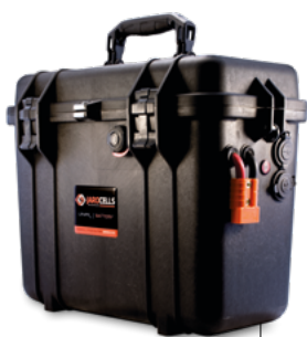
BTP120.12 PRO BTP150.12 PRO