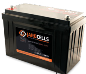
BT150.12 BT60.24 BT30.36